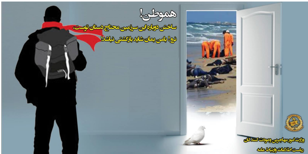
Figure 2. A poster shared on social media by the Afghan Ministry of Refugees and Repatriation, warning their ‘compatriot’ of the potential risks of migration, and pointing out starkly that there may be no return