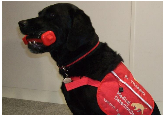
Figure 1. DAD in training dog holding a bringsel in the typical gesture made to communicate to his handler.

One recurrent theme we identified was the problem of reliability in recognizing the dogs' alerts. Occasionally, a dog's owner could not distinguish between when the dog was alerting and when the dog was merely spontaneously performing a similar behavior. To address this issue, the practice of teaching the dog to retrieve a particular object, called a bringsel, is becoming popular (see Figure 1). A bringsel is a distinct tube or "U" shaped object that usually hangs from a dog's collar and that the dog uses only in specific circumstances. The concept originated from search and rescue dogs, who were trained to only take the bringsel in their mouth when they had found a missing or injured person. Holding the bringsel in their mouth would therefore unambiguously signal that the dog had found something, thus the handler would be sure of what the dog meant.