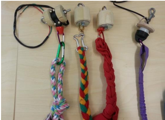
Figure 2. Physical prototypes used during testing, consisting of wooden base, trigger mechanism, and bringsel, or ‘tuggy’ part for the dog to interact with.

During testing, much of our focus was on the ergonomic experiences associated with a range of trigger mechanisms. For example, the strength required for the pulling action, the tactile sensation when pulling, the sound produced by the triggering mechanism, the smell of the materials and other physical stimuli. Specific trigger mechanisms we used include: