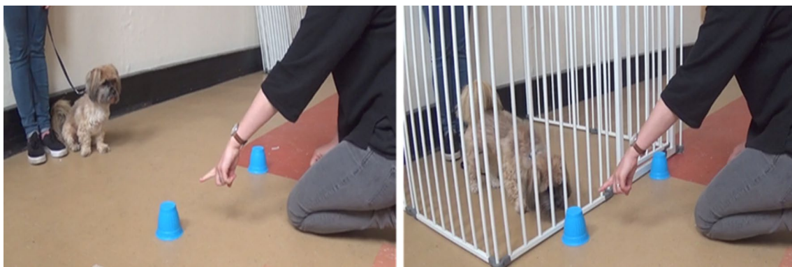
Fig. 1 Experimental setup in the two conditions. The owner stood at a distance of 184 cm from the experimenter holding the subject on a 1 m lead, such that the nearest distance between subject and experimenter (depending on the size/position of the subject) was 60 cm.

The playpen used in the barrier condition was a Dreambaby Royal Converta 3-in-1 Playpen Gate, measuring 380×4×74 cm (Dreambaby, Unit 53, Rosyth Business Centre 16 Cromarty Campus, Rosyth, KY11 2WX, Scotland). The containers used to hide the bait were two opaque plastic cups. A premium commercial dry dog food was used for baiting the cups. All dogs were tested on a 1 m-long lead. All testing sessions were recorded on two Sony Handycam HDR-PJ410 video cameras (Sony, 1-7-1 Konan Minato-ku, Tokyo, 108-0075 Japan). The owner stood at a distance of 184 cm from the experimenter holding the subject on a 1 m lead, such that the nearest distance between subject and experimenter (depending on the size/position of the subject) was 60 cm. The experimenter was positioned 60 cm from the edge of the barrier in the barrier condition. The distance between the two containers was 60 cm, and the distance