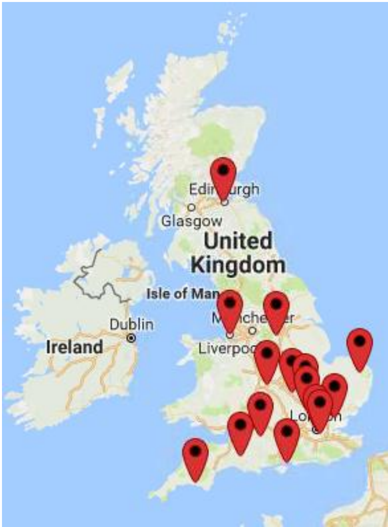
Figure 1. Geographic distribution of participants across UK

NB - there are only 15 locations on the map as some areas represent multiple participants