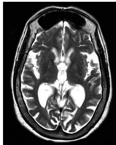
Figure 2. T2-weighted image MRI from case 1.

The second case was a 52-year-old patient who was easily sunburned since childhood, and had lentigines since the age of 2 years. Regarding previous pharmacological treatments, no prior dopamine antagonists were noted. A melanoma in the right corneal limbus was detected at the age of 22 and the first of multiple nonmelanoma cancers was diagnosed 7 years later. Due to a recurrence of the melanoma, an enucleation of the eye was performed at the age of 36 years old. Neurologically, the patient presented at the age of 17 with severe bilateral sensorineural hearing loss. On examination, the patient had dense lentigines and hypopigmented macules on sun-exposed sites such as the face, neck and arms. There were also numerous cherry angiomas at those sites. Choreic movements, with grimaces and emotional lability were noted. Despite normal tone and power throughout, pyramidal signs were found (brisk reflexes and bilateral Babinski's sign). The upper limbs showed dysmetria and intentional tremor. There