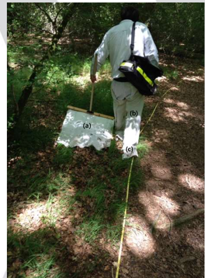
Figure 2 (above). Drag sampling in the South Downs National Park, UK. Tick sampling with woollen (a) blanket (b) chaps and (c) flags.