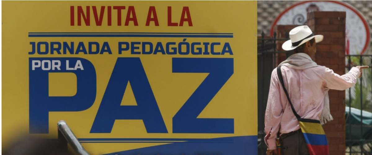
The 'Yes' campaign failed to fire Colombians up.

There were attempts to engage them: touring meetings and talks where people would be spoken to and have their opinions listened to, adverts and documentaries in which former enemies publicly reconciled, a website on which people could post their opinions. Nevertheless, the lack of interest was palpable – and for some reason, it apparently didn't strike the negotiators as a significant problem.