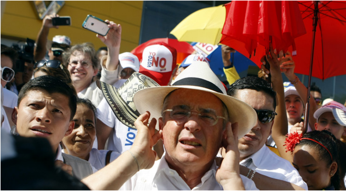
Álvaro Uribe on the trail for 'No'.

Uribe also stood to lose out personally from the deal. The central pillar of his legacy was the military campaign that weakened FARC to the point that they would negotiate. Yet, his well-reported connections to paramilitaries who killed thousands of civilians while fighting FARC indicate a dirtier side to this war. Many of his political allies – including his head of intelligence, his brother, and his cousin (who was his campaign manager) – are now behind bars for colluding with paramilitaries to advance their political and business ambitions.