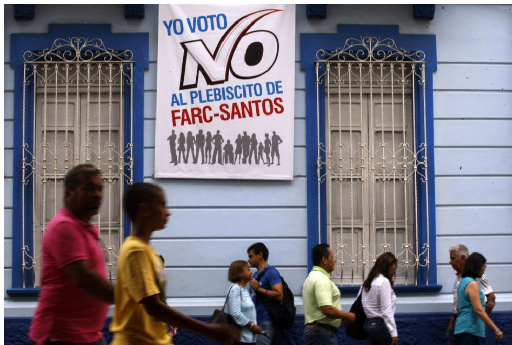
Going about their business.