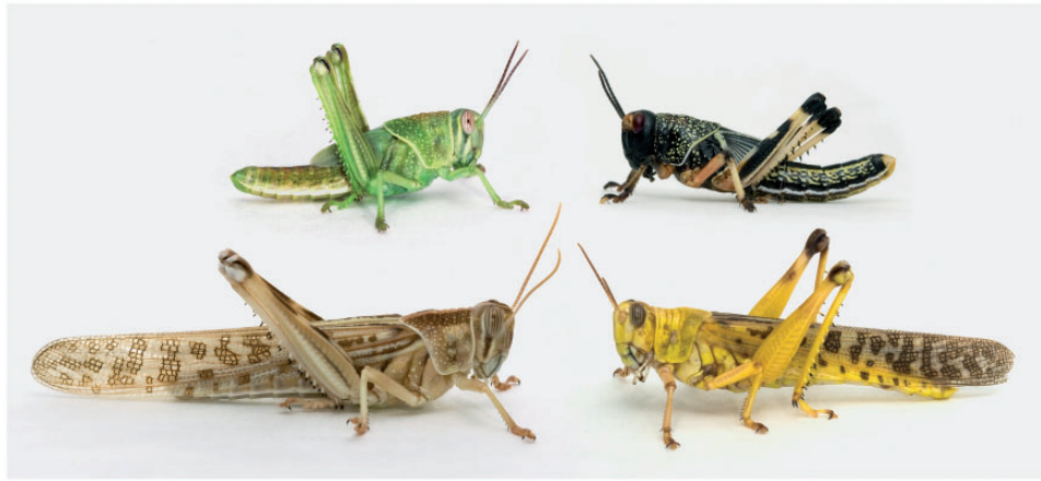
Fig. 1 Solitary and gregarious locusts differ in their external morphology. Although there are differences in body size and shape, the most obvious difference is that larval (upper, left) and adult (lower, left) solitary locusts are camouflaged, whereas larval (upper, right) and adult (lower, right) gregarious locusts are aposematic. Modified from Burrows et al. (2011) .

the phase-dependent reinforcement valuation observed in desert locusts is an adaptation that serves not to optimize dietary breadth within each phase, but rather to support different feeding behaviors underlying different anti-predator strategies.