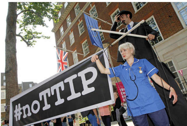
TTIP for the chop? NHS fears have sparked protest.

At its heart, the far more valuable non-tariff route drags up fears, founded or unfounded, of a regulatory race to the bottom on things like food safety, and objections from NGOs about the loss of domestic policy power on things like health or government procurement. Crucially, TTIP has also raised the (contested) possibility of major corporations suing states.