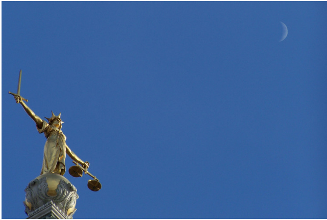
Blue sky thinking? State dispute settlements divide opinion.

But critics still question such guarantees because no one knows how an ISDS tribunal, even if it was a properly constituted court, would interpret any legal text intended to protect public policy objectives.