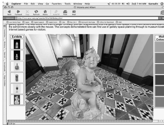
Fig. 3. An artifact in the AR interface.