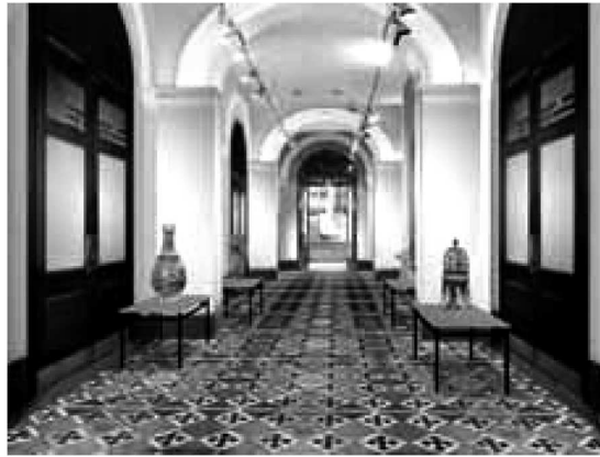
Fig. 1. Museum exhibition using VR.