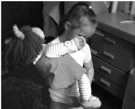
Figure 1 DW Toy